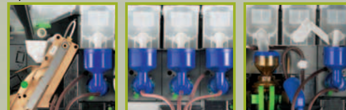
Fresh Brew Version