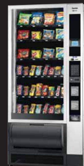
All snack version