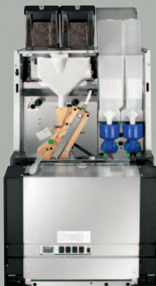
Example of Espresso Version (indicative)