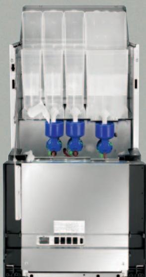
Example of Instant Version (indicative)